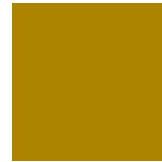
PMS 118 C

C: 38 R: 110 M: 57 G: 78 Y: 54 B: 71 K: 47 #6e4e46