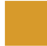
PMS 7563 C

C: 7 R: 173 M: 33 G: 132 Y: 100 B: 0 K: 33 #ad8300