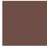
PMS 7518 C

C: 38 R: 110 M: 57 G: 78 Y: 54 B: 71 K: 47 #6e4e46