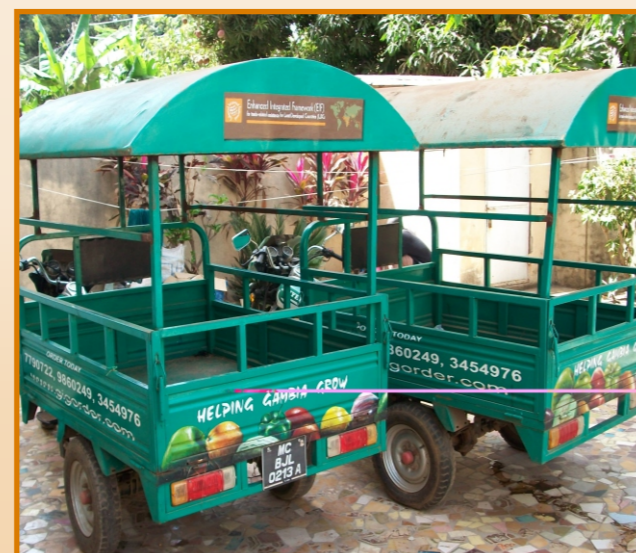
Motorbicycles were bought for to aid in the distribution of horticulture produce

Trade Related Assistance for least developed countries