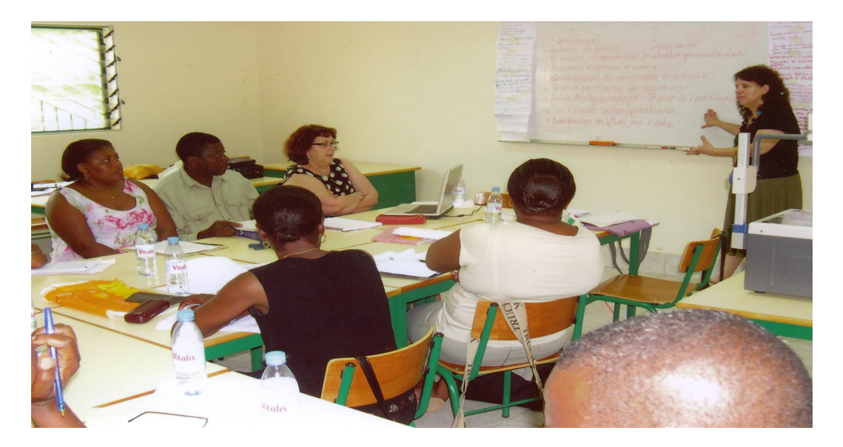
Fig. 1: Training session for literacy instructors

The literacy partnership program also provided the opportunity for a Brazilian technical team to offer technical training to literacy workers and coordinators in São Tomé and in the autonomous region of Príncipe in youth and adult education methodology.