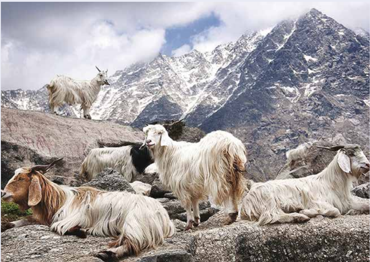
High Mountain Pashmina Goats known as "Chyangra"