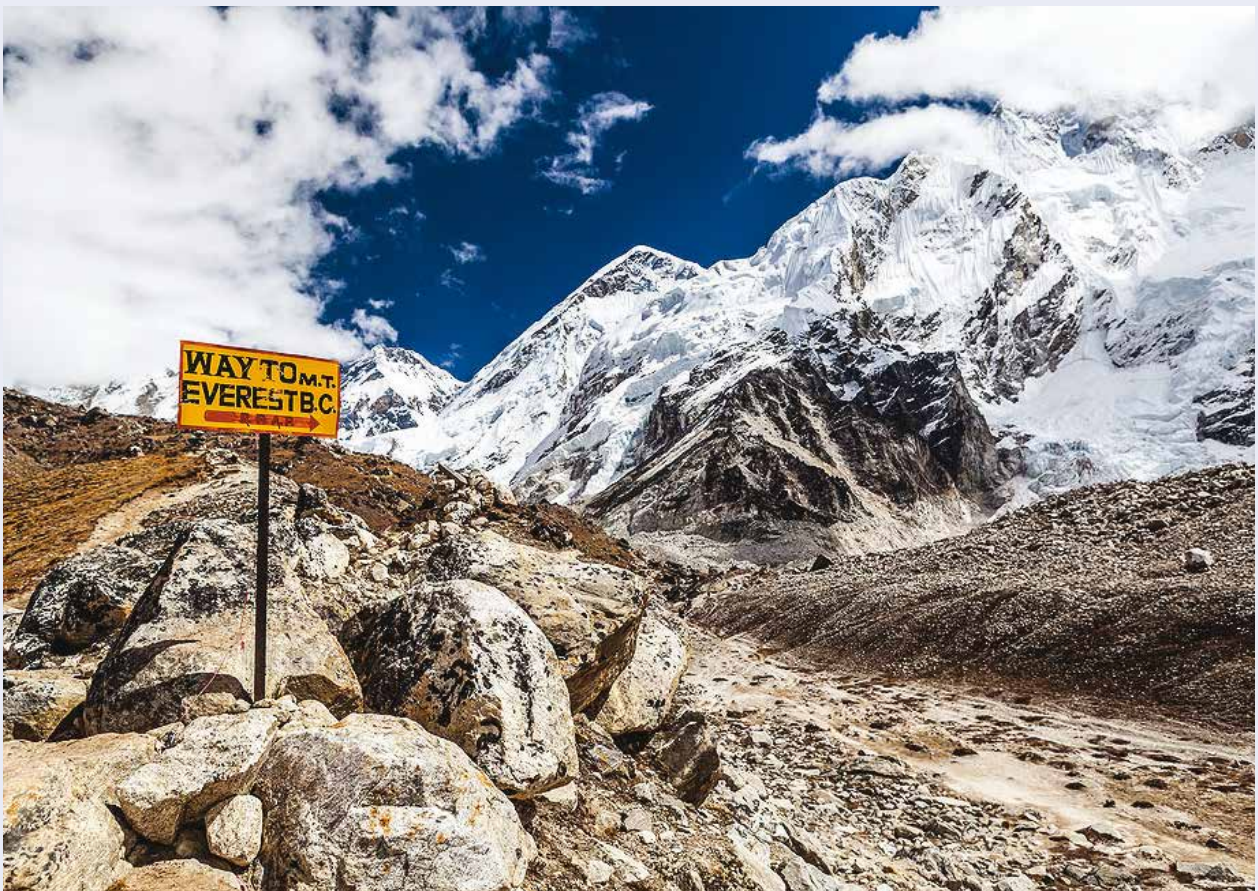
Mt Everest Base Camp trekking route